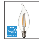
SPJ-2W-CB-C 2W 12V or 120V

Unlimited LED Lumen Packages & Color Temperatures Available!