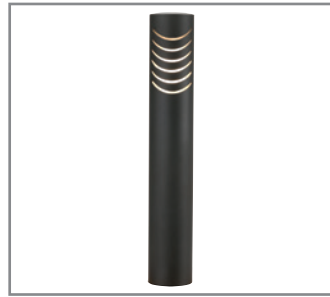
Model: SPJ-TW3-1 Finish: Black