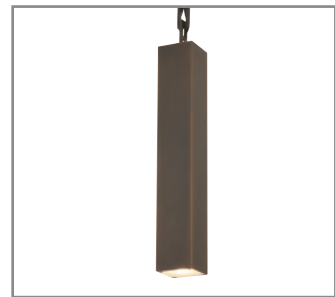
Model: SPJ-SQ8-H Shown: Matte Bronze