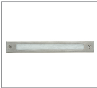
Model: SPJ-SM9 Finish: PVD Satin