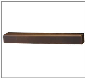
Model: SPJ-SC-9 Finish: Matte Bronze