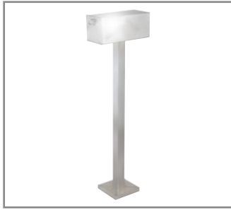
Model: SPJ-MB-200 Finish: PVD Polished