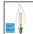
SPJ-2W-CB-C 2W 12V or 120V

Unlimited LED Lumen Packages & Color Temperatures Available!