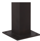
SPJ-DM6SQ (SHOWN) SPJ-DM8SQ 8" Deck Mount