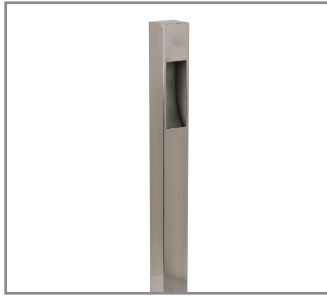
Model: SPJ-CC24-2REC Finish: PVD Satin