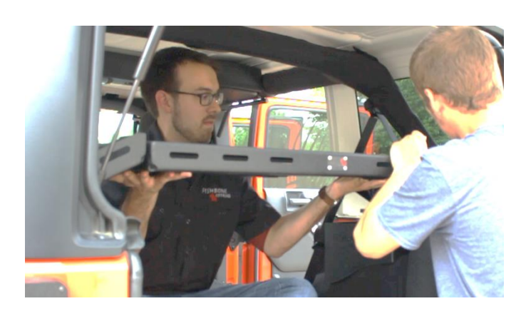
Secure each side with (3) Bolts, (6) M10 Flat Washers, and (3) Nyloc Nuts.

FB25218 PART No. Jeep® 07'- 18' 2-Door JK Wrangler Luggage Rack