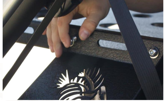
Tighten down the bolts with a 17MM Socket and a 6MM Allen wrench.

Secure each side with (3) Bolts, (6) Flat Washers, and (3) Nyloc Nuts.