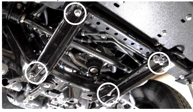
With a 12mm socket, remove the 4 bolts from each rear crash bar.

Next, with an 18mm socket, remove the 3 bolts securing each front crash bars. Retain 2 of these to be reused in Step 2.