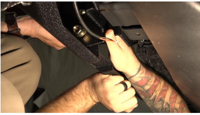
Reconnect your sensor harness.

With the help of a friend, hold the bumper up to the mounting brackets and with included hardware, secure the bumper to the frame with a 18mm socket and 18mm wrench.