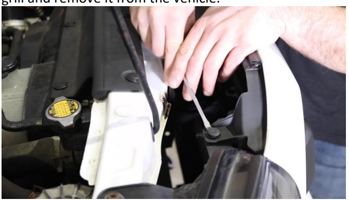
Gently pull at and remove the lower plastic bumper.

With a screw driver, remove the two top push clips just inside the grill. Gently and evenly tug at the grill and remove it from the vehicle.