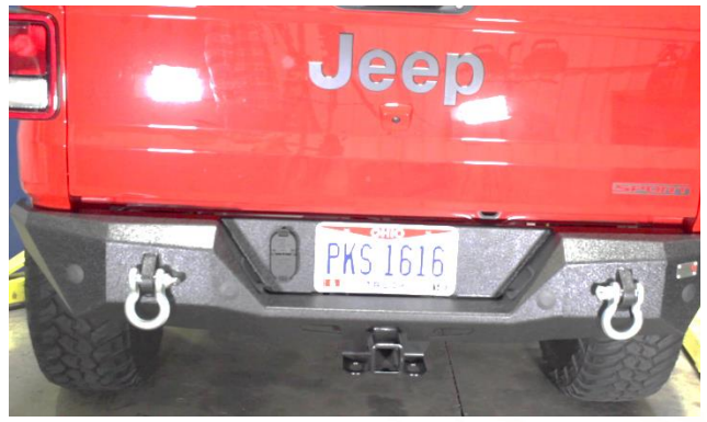
ENJOY YOUR NEW FISHBONE OFFROAD JT MAKO REAR BUMPER!