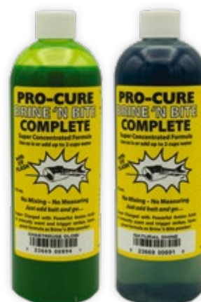
CHARTREUSE GLOW NATURAL SHINE