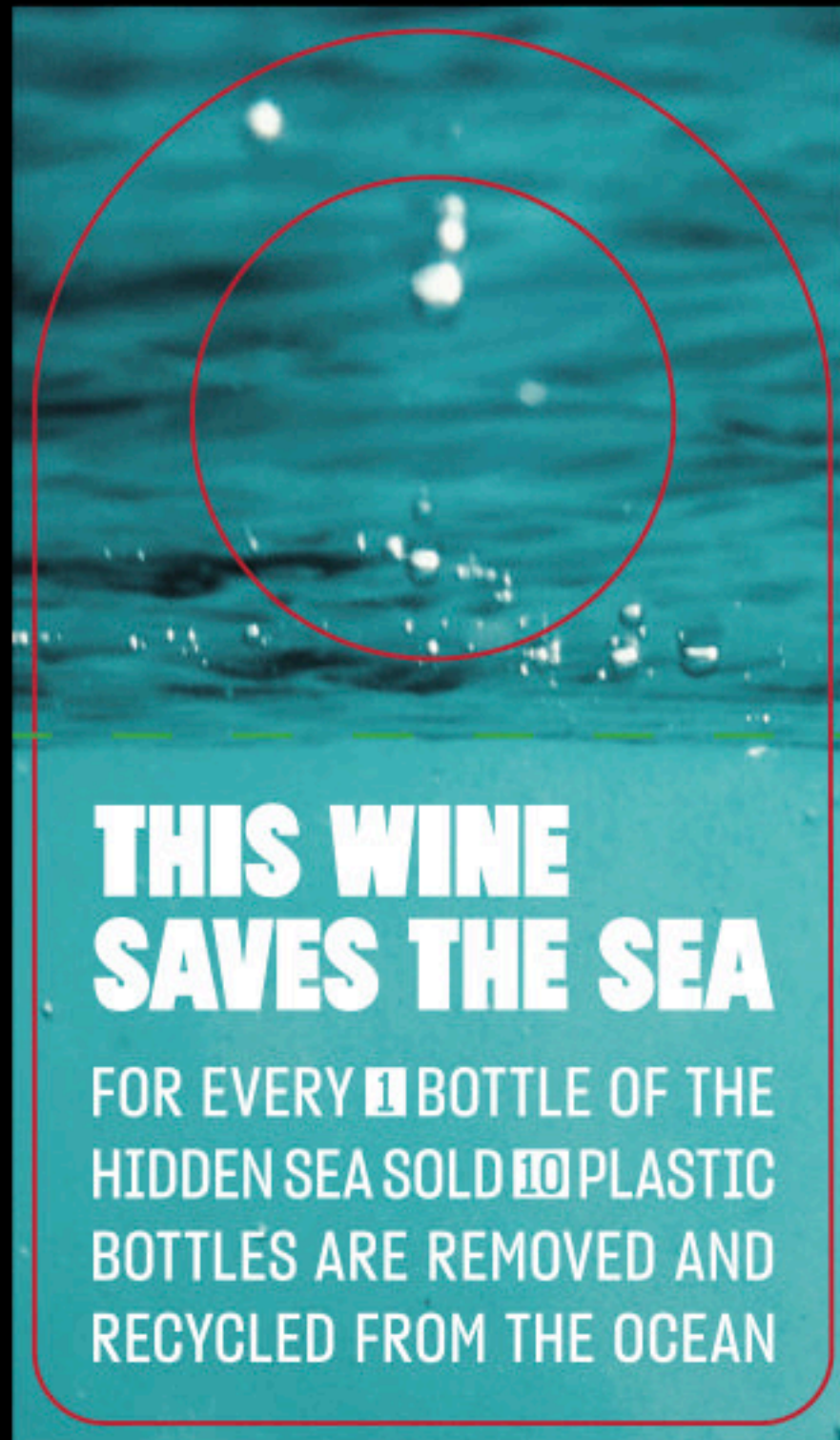
NECK TAG claret Essence with Promise