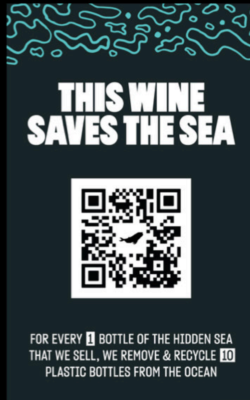
SHELF TALKER (2.5"x4.0")