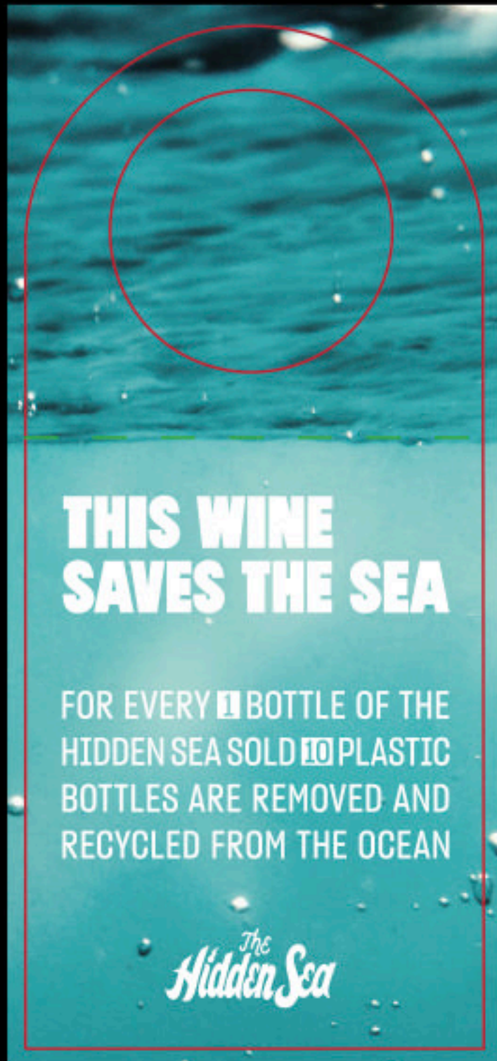
NECK TAG burgundy Essence with Promise