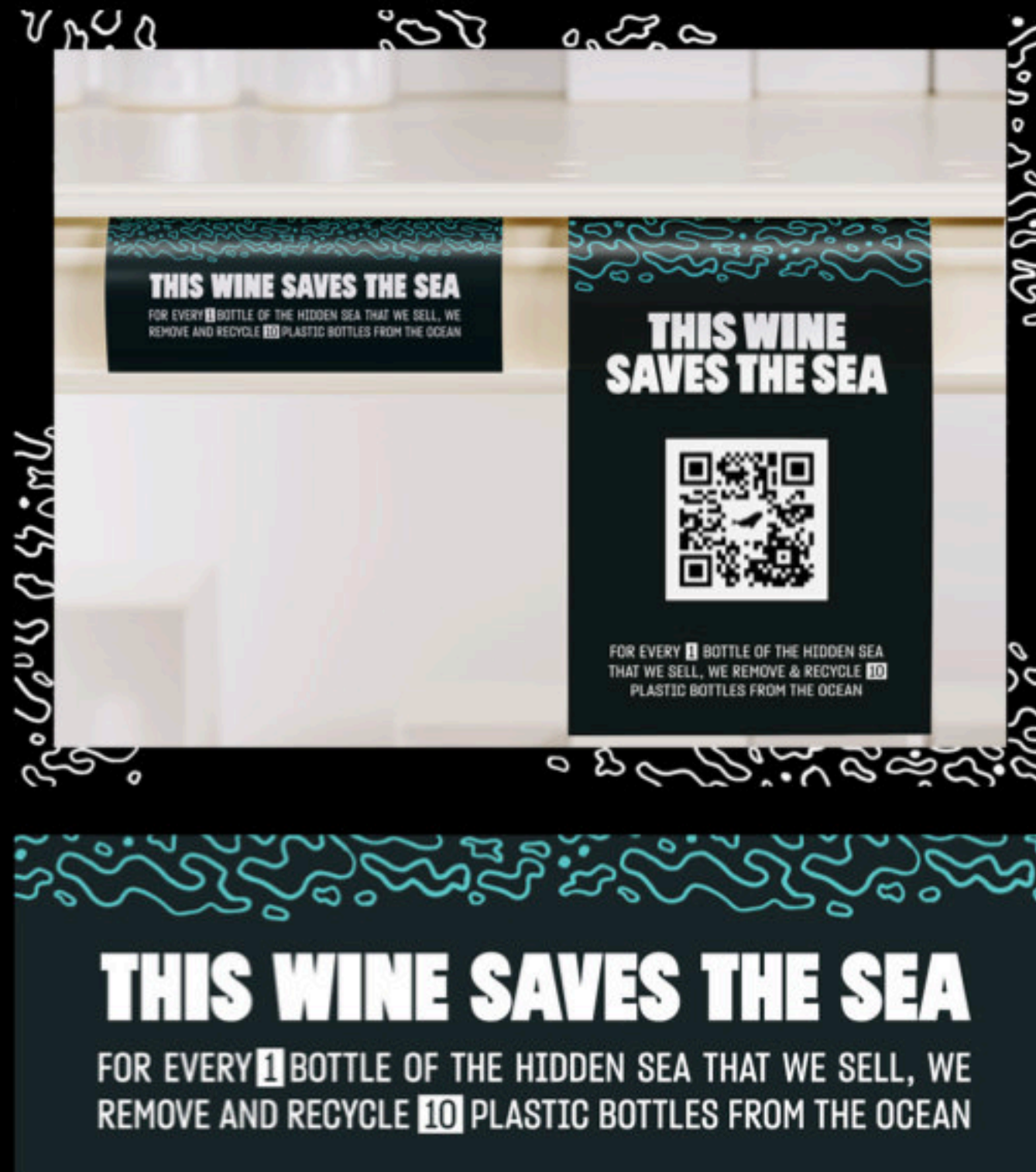
SHELF TALKER (3.0"x1.0")