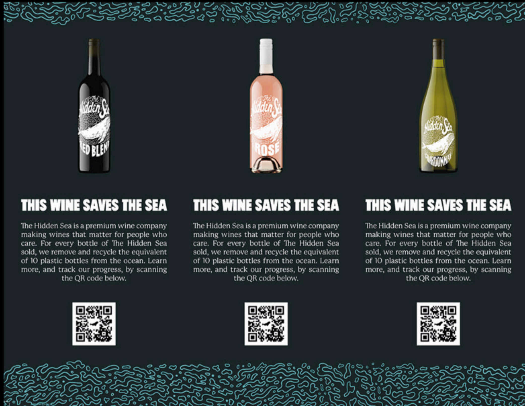
TABLE TALKER (trifold)