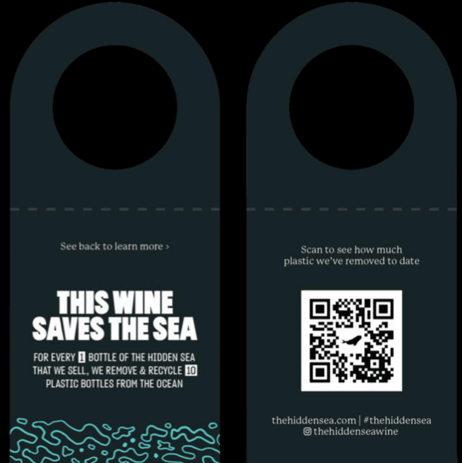
NECK TAG Brand Essence with Promise, and QR code on back