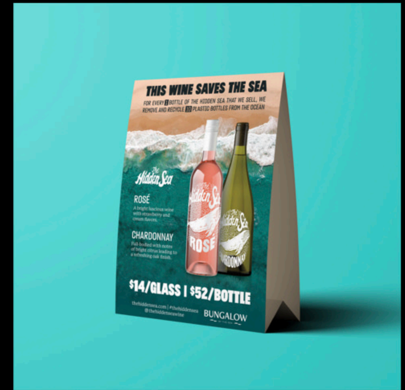
TABLE TALKER (tent)

Essence and Promise with SKUs, notes, and prices