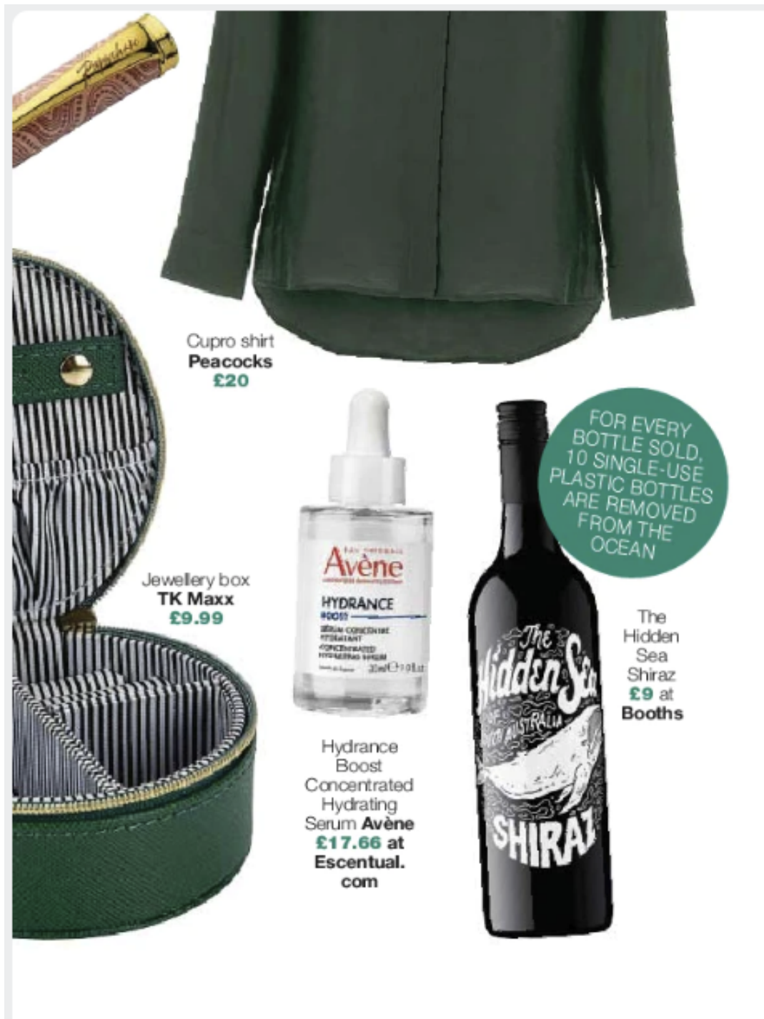
Cupro shirt Peacocks £20