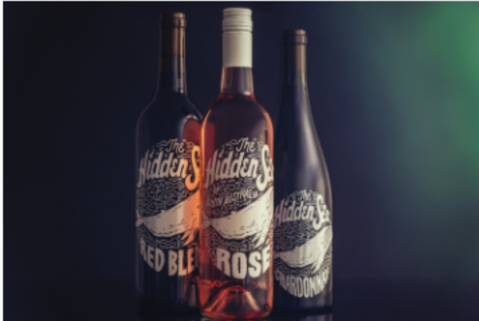
The Hidden Sea works to clean plastic from the ocean