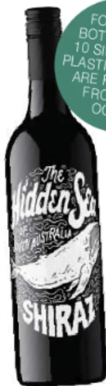
The Hidden Sea Shiraz £9 at Booths

FOR EVERY BOTTLE SOLD, 10 SINGLE-USE PLASTIC BOTTLES ARE REMOVED FROM THE OCEAN