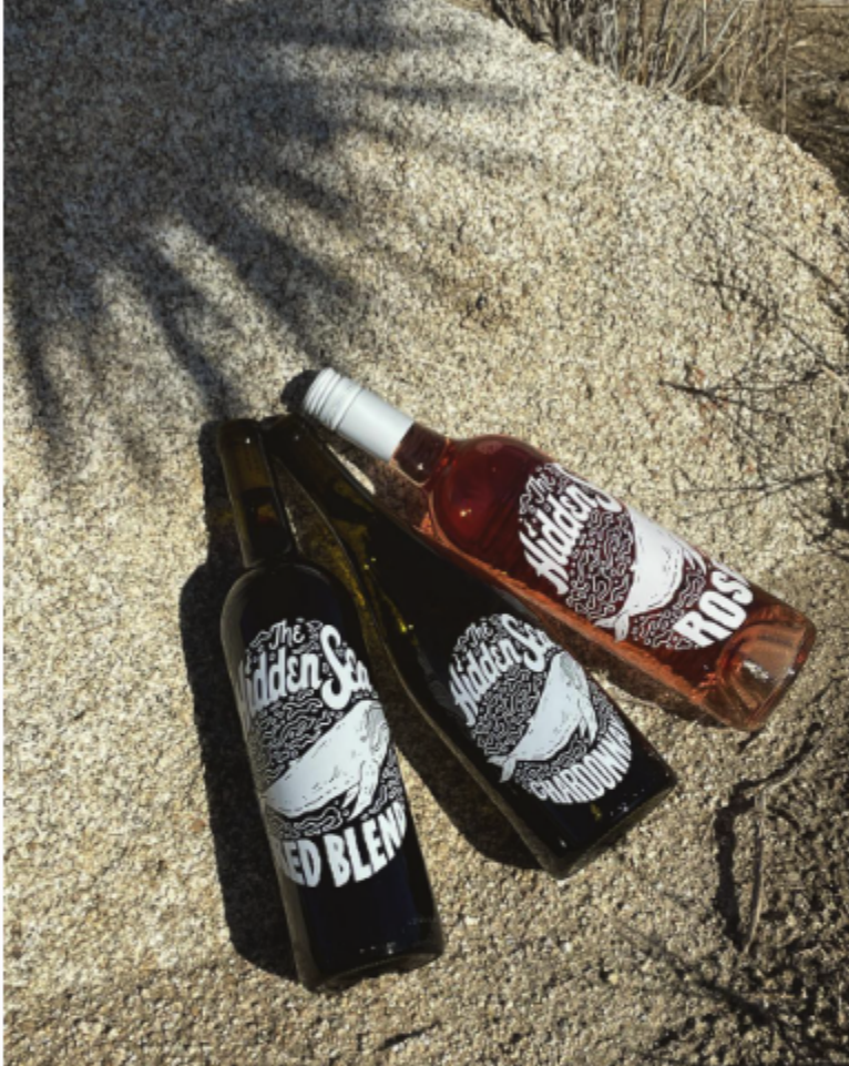
The Hidden Sea 2022 Rosé THE HIDDEN SEA

The sustainability-minded couple is going to incorporate their environmentally friendly mindset into their romantic date night, and this wine has a really sweet story: For every bottle of The Hidden Sea sold, 10 plastic bottles are removed from oceanic waterways. This means it's not just a romantic dinner pairing, but working together to fight climate change. That's hot, isn't it? The Hidden Sea's 2022 Rosé is subtly sweet and vibrant with a delicate fruity finish. Enjoy with delicate seafood or a cheese course.