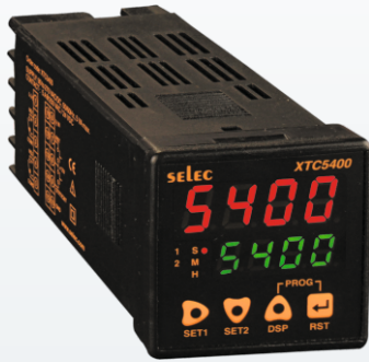
48 x 48 mm