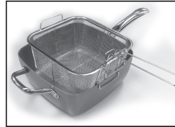
Fry Basket can hook on edge of pan to drain off excess oil.