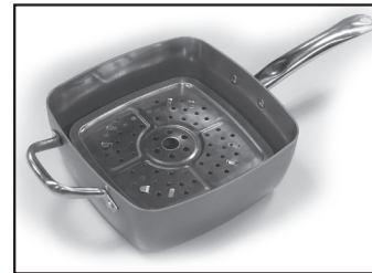
Steamer Tray in Pan