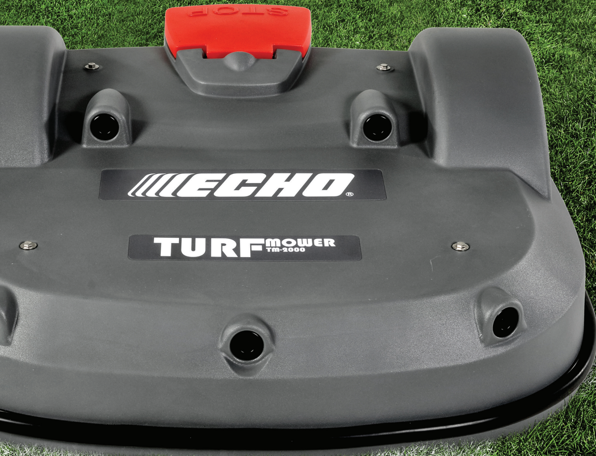
TM-2000 Turf Mower

It's a self-driving, self-charging and -best of all - self-sufficient mower that allows busy turf managers to refocus their time, budgets and resources on more important things.