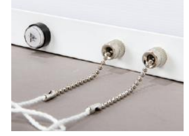
Indicator nightlight to easily locate pull chain location in the dark