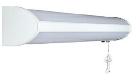
Independently control upper and lower light panels