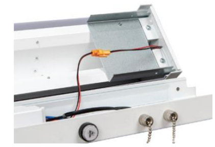
Easily disconnect lens assembly from Backplate during installation