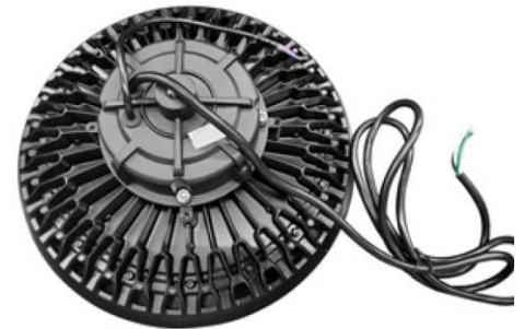
Dimming 0-10V and 6ft long power cable are standard. Custom configurations available.