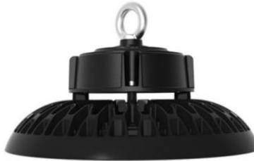
Effective heatsink design. Remarkable performance in high ambient temperatures.