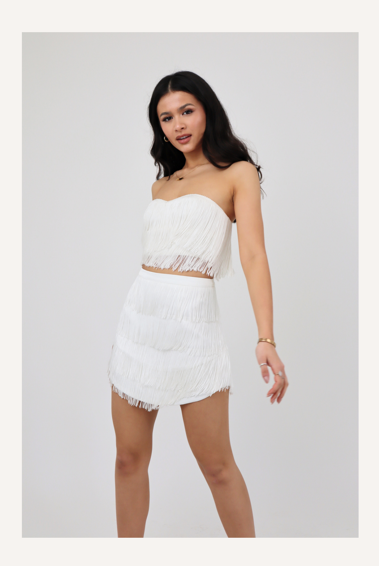
THE TASSEL MINI SKIRT RRP £60