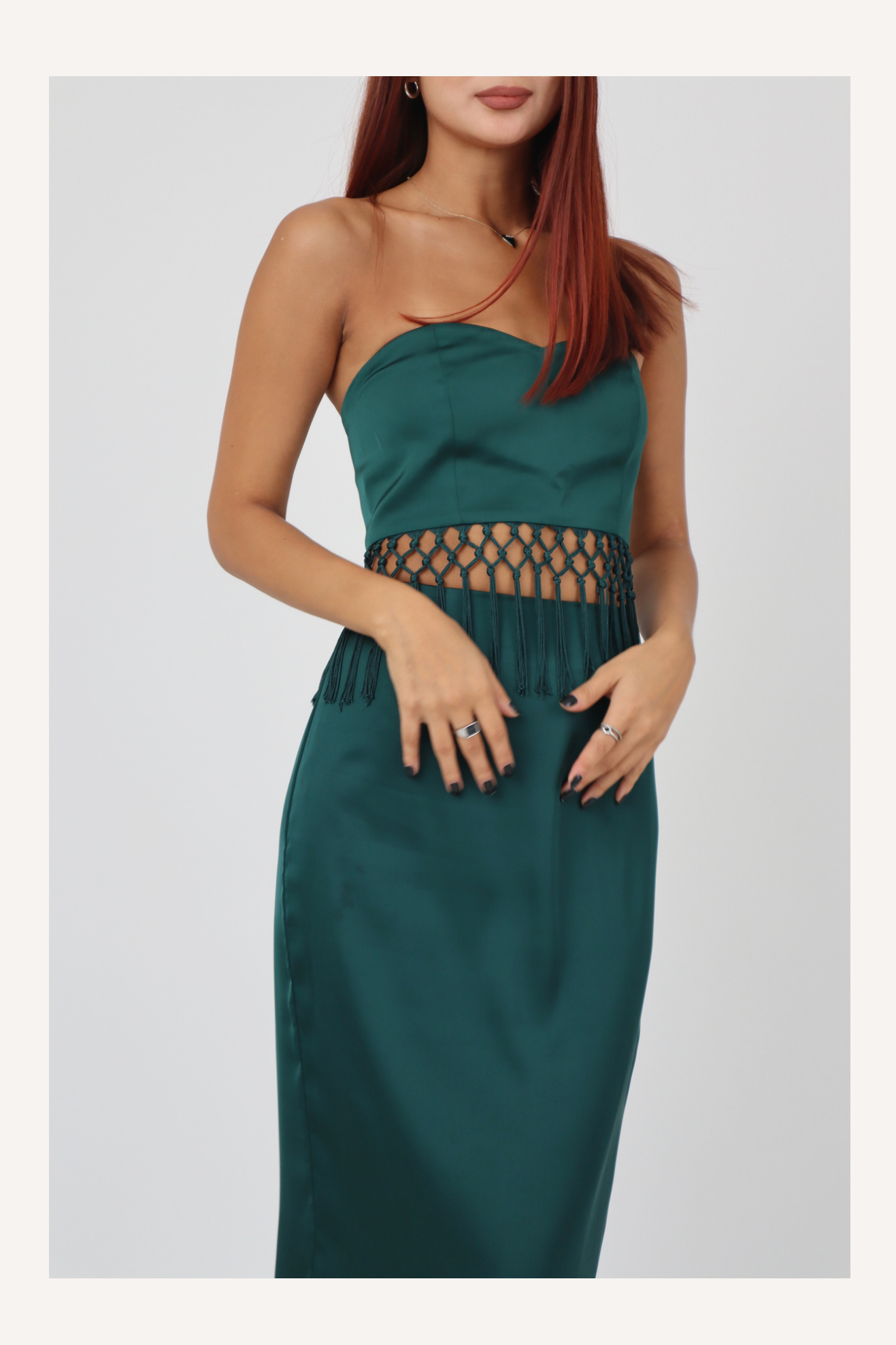
THE MACRAME TASSEL TOP RRP £50