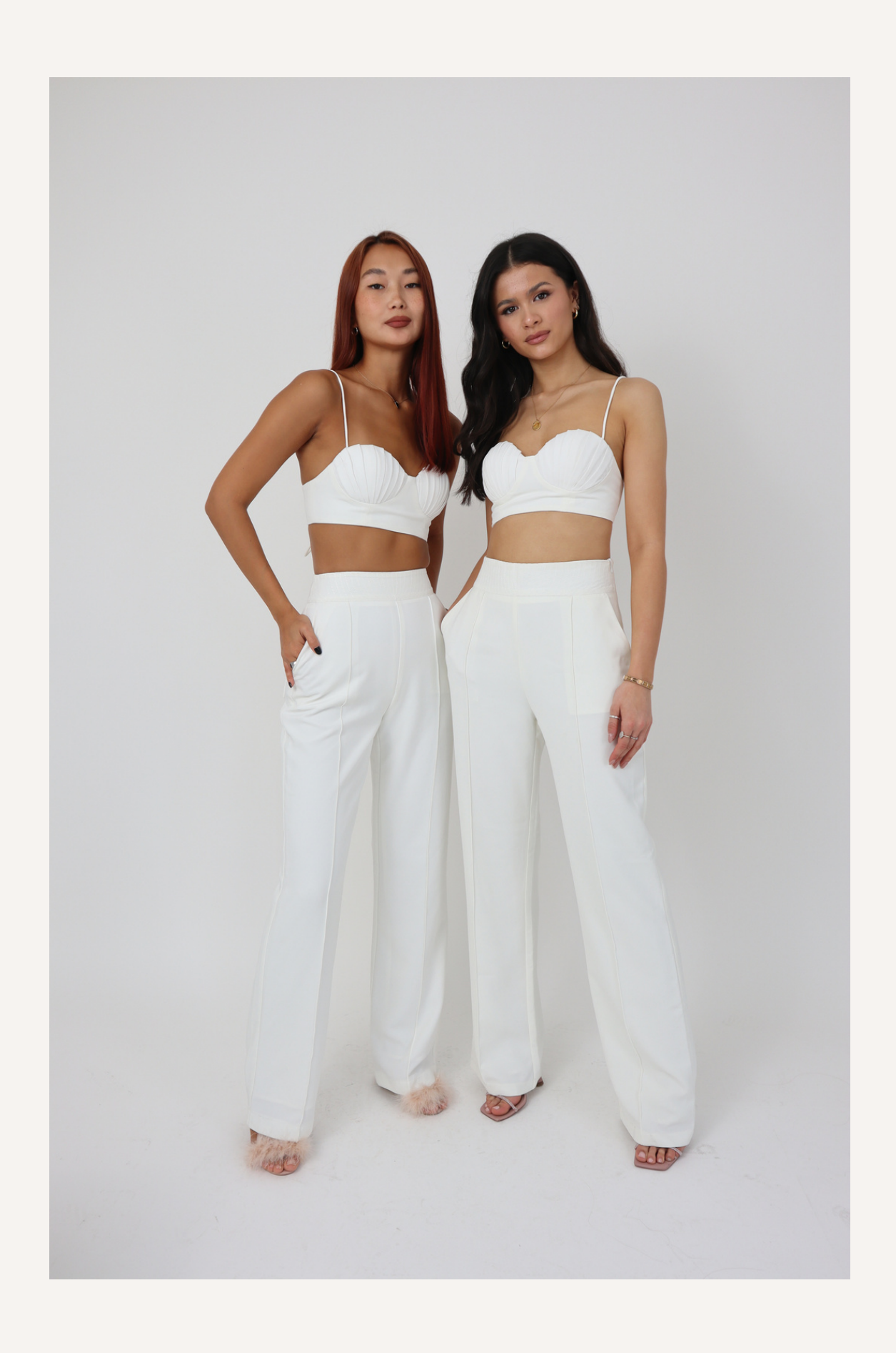
THE SHELL TROUSER RRP £75