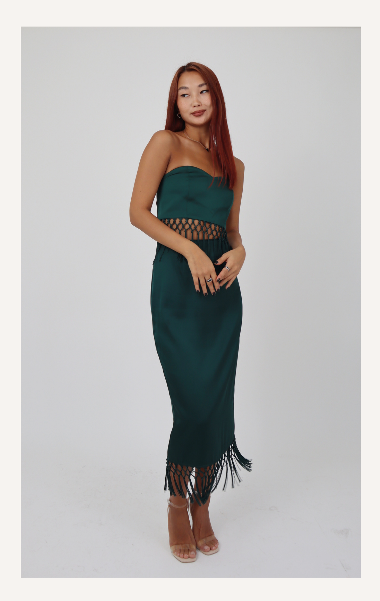
THE MACRAME TASSEL SKIRT RRP £65