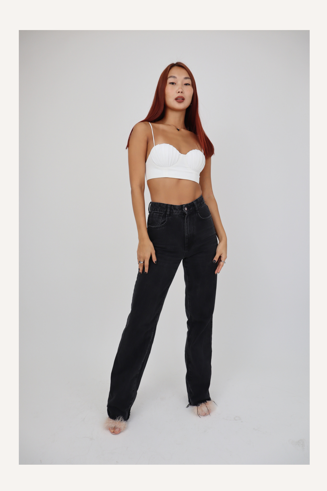
THE SHELL BRALETTE RRP £55