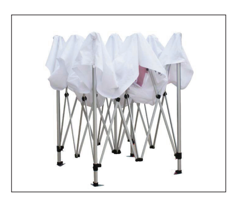
4.Lay canopy over top of frame