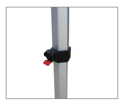
9. Lift the 2 adjacent outer legs and slide out the inner legs until the snap button locks into the hole in the outer leg