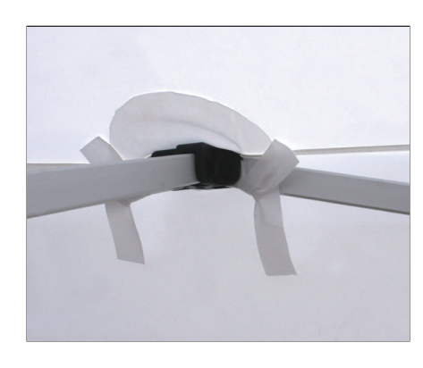
8. Secure top with tabs