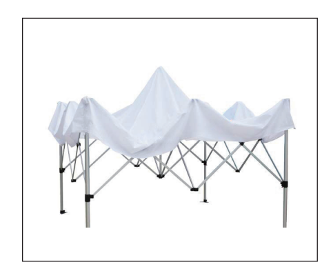
7.Lift inside pole in center to extend frame completely