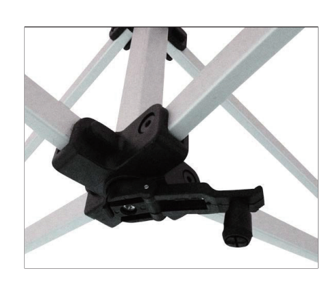
11. Spin winder in the center of the frame to completely tighten tent