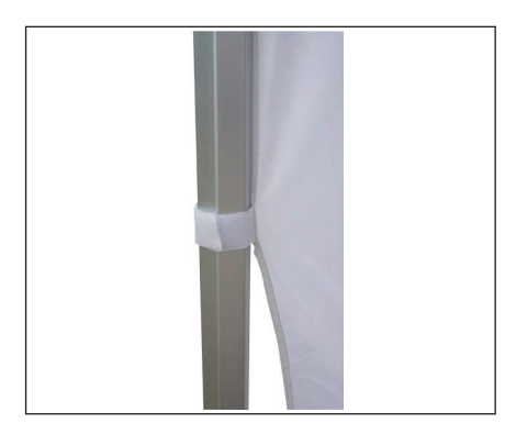
14. Secure to side poles with Velcro strips (x4 per pole)