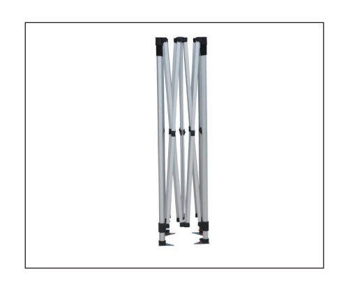
2.Place feet on stable ground