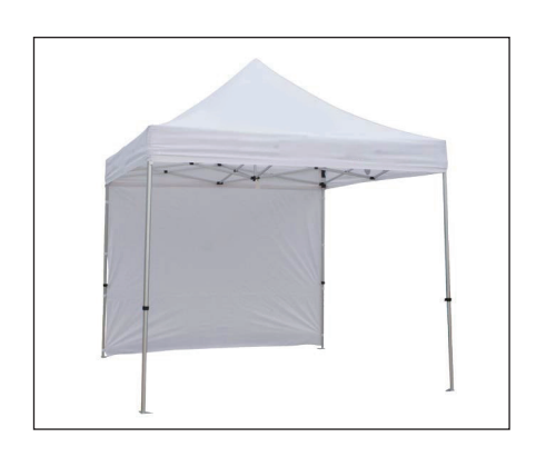
15. Fullwall assembled