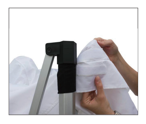
5. Align the canopy top over the frame corners and place Velcro on all 4 corners (none on top piece)