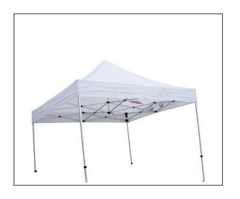
10.Repeat on opposite legs; Make sure to do two legs at a time. *Minimum of two people recommended.