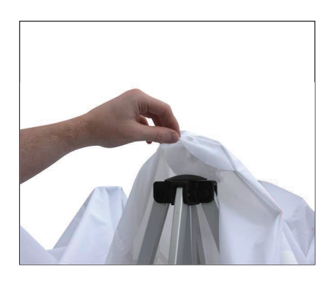
6. Make sure canopy is flush on hardware