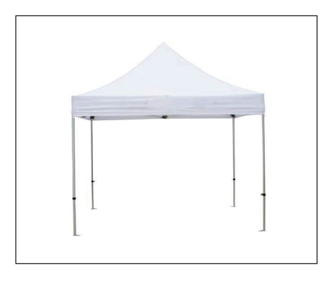
12.Canopy kit assembled