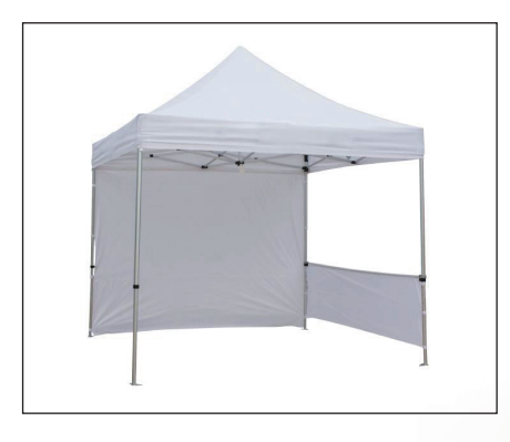
17. Halfwall assembled