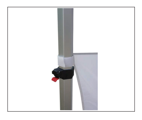
16.Attach each side of pole to pole collar; Secure with Velcro strip (x3)