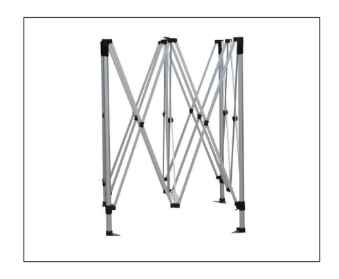
3.Extend frame to extended size of 4' x 4'