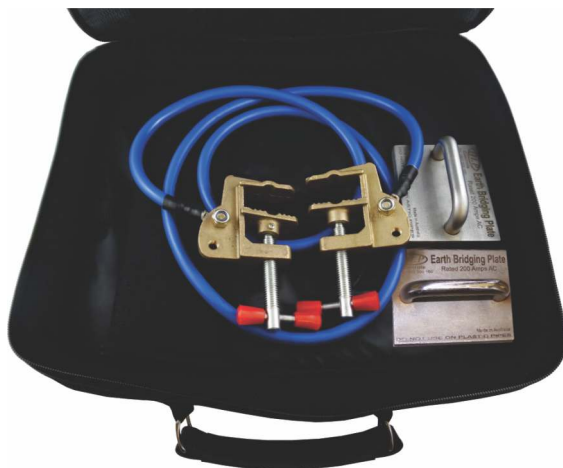
Bridging kit shown with 1.5 meter shunt cable with screw clamps & Bridging plates