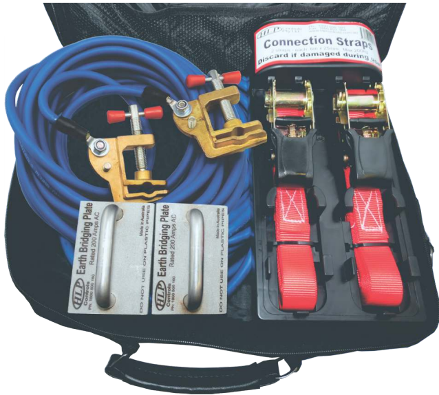
Bridging plate kit shown in the optional carry bag along with 10 meter shunt cable, screw clamps (alligator clamps also available) & ratchet straps