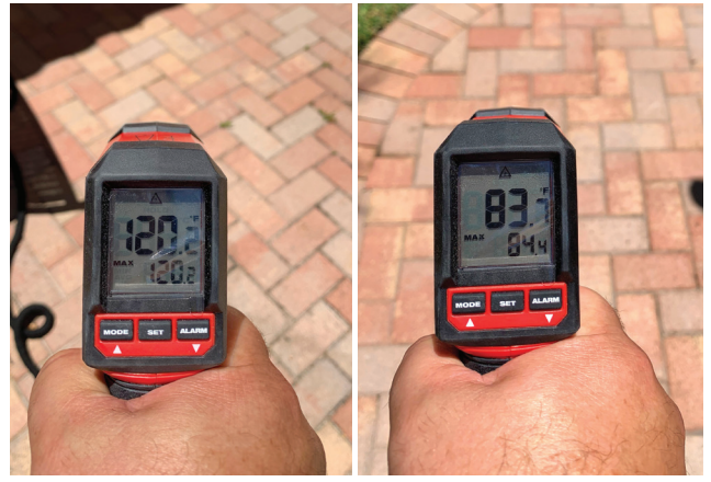
Before coating air temp 83°F. surface temp 120.2°F After coating air temp 85°F. surface temp 83.7°F Lowered by 36.5°F