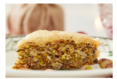
Pistachio Only fresh pistachios, roasted and dusted with salt will do, layered high with housemade syrup.