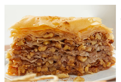
Classic Walnut The golden standard of baklava deliciousness.

Includes 4 Baklava Diamonds in Linen Gift Box.