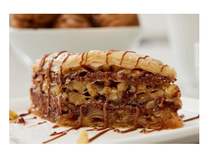
Milk Chocolate Creamy Callebaut milk chocolate provides a chocolaty burst with a silky-smooth finish.