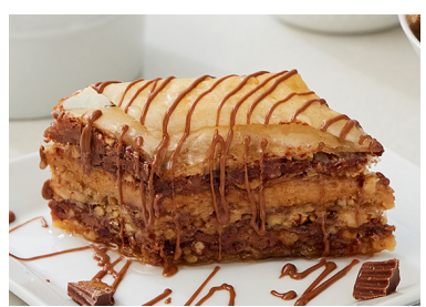
Peanut Butter Cup Layers of peanuts, Callebaut creamy milk chocolate with natural peanut butter filling elevate this flavor beyond it's candy bar cousin.