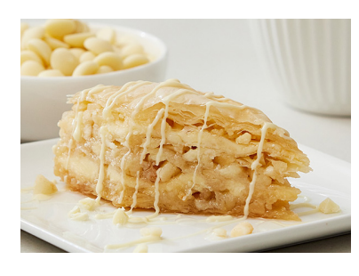
White Chocolate Macadamia Nut Hawaiian macadamia nuggets compliment rich Callebaut White Chocolate layers for decisively authentic flavors.