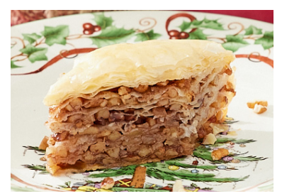
Pecan Pumpkin Spice Our vivid fall spice blend makes this a go-to flavor for Thanksgiving or any time of year.