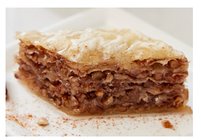
Pecan Simple indulgence, farm fresh pecan pieces are nestled in layer on layer of flaky filo, finished with our housemade syrup.