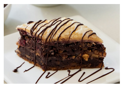
Dark Chocolate Layers of Callebaut Belgian dark chocolate deliver the true cocoa-sweet-bitter flavor that lingers.