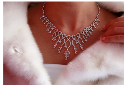
Jewelry is a common Valentine's Day gift.

There are many theories for how Valentine's Day began. During the Roman Empire, Emperor Claudius made it illegal for soldiers to get married. He believed that single, unmarried men