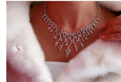
Jewelry is a common Valentine's Day gift.

Valentine's Day first became a holiday and an annual event on February 14 in the late 5th Century. From the 17th Century onwards, Valentine's Day became more popular and more widespread. Famous poets Geoffrey Chaucer and William Shakespeare helped make Valentine's Day more popular because of their writings.