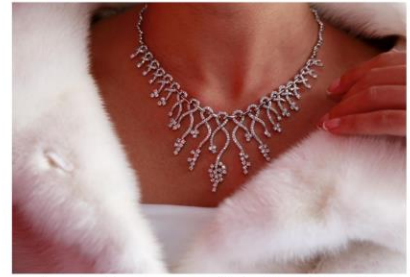
Jewelry is a common Valentine's Day gift.

Valentine's Day is celebrated on February 14th each year. The history of Valentine's Day goes back hundreds of years. The tradition has evolved greatly over time and how people celebrate Valentine's Day today.