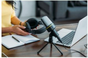
Podcast Recording Set Up

Each podcast episode is usually about a specific topic.