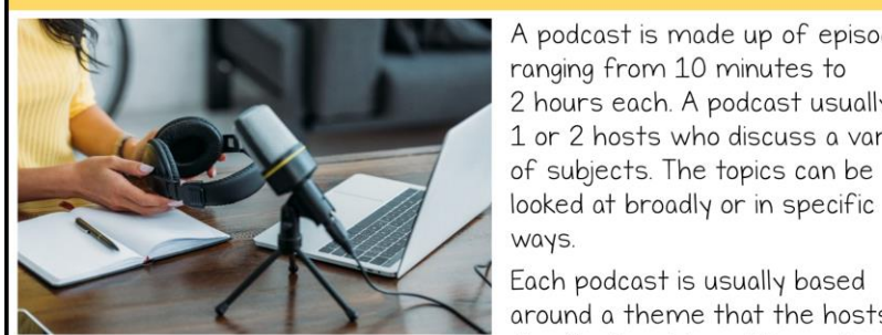
Podcast Recording Set Up