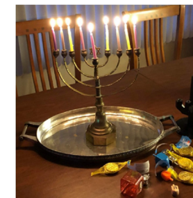
The menorah is used during Hanukkah.

Hanukkah starts on the 25th of Kislev (a Jewish calendar) and is known as "Chanukah" in Hebrew. It usually occurs in November or December.