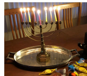
The menorah is used during Hanukkah.

The holiday reminds Jewish people to focus on their faith and culture. Gift exchanges, traditional food and games, as well as lighting the menorah are all part of this holiday celebration. It is known as the Festival of Lights.