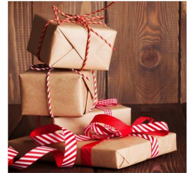
Some people exchange presents around Christmas time.

When people think of Christmas, two images come to mind: the religious Christmas symbolized by the Nativity scene or the commercial Christmas symbolized by the beautifully decorated Christmas trees in shopping malls.