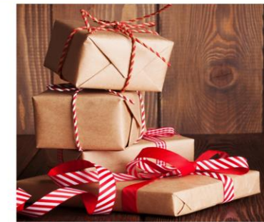
Some people exchange presents around Christmas time.

Christmas is a holiday celebrated in North America and many other parts of the world.