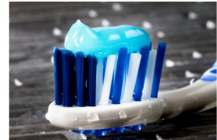
Many astronauts choose to use edible toothpaste while in space.

Astronauts can request special foods for their stay on the ISS, either favourite foods or foods from their culture. For example, when Canadian astronaut Chris Hadfield stayed on the ISS, he received maple syrup cookies and candied wild smoked salmon.