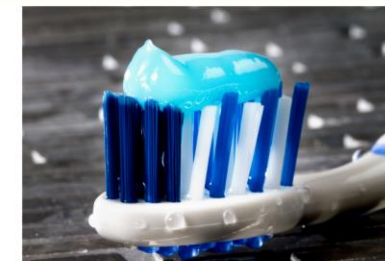
Many astronauts choose to use edible toothpaste while in space.

Astronauts can request special foods for their stay on the ISS. For example, when Canadian astronaut Chris Hadfield stayed on the ISS, he received maple syrup cookies and candied wild smoked salmon.