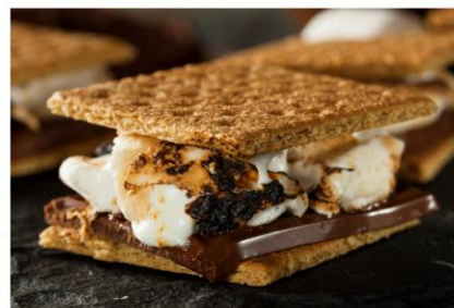
S'mores are a popular treat.

Have you ever wondered from where your favourite dessert originated? Technology and transportation methods have improved greatly over the last century making it easier to share recipes around the world.