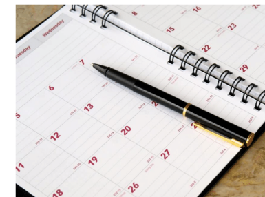
Mark April 1 st on the calendar.

April Fools' Day, also known as All Fools' Day was first popularized on April 1, 1700. The idea of April Fools is to prank each other, while having harmless fun. The annual tradition's exact roots, however, are unknown.