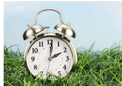
People change their clocks during Daylight Savings.

By changing people's coal consumption, energy was saved.