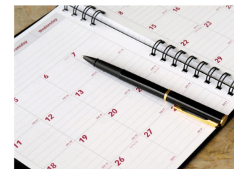
Mark April 1 st on the calendar.

April Fools' Day, also known as All Fools' Day became popular on April 1, 1700. April Fools is a day to play jokes on people while having fun.