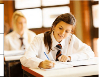
School students wearing a school uniform.