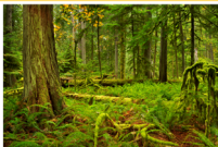
Bigfoot is said to live in forests

When immigrants arrived in Canada and the United States they started