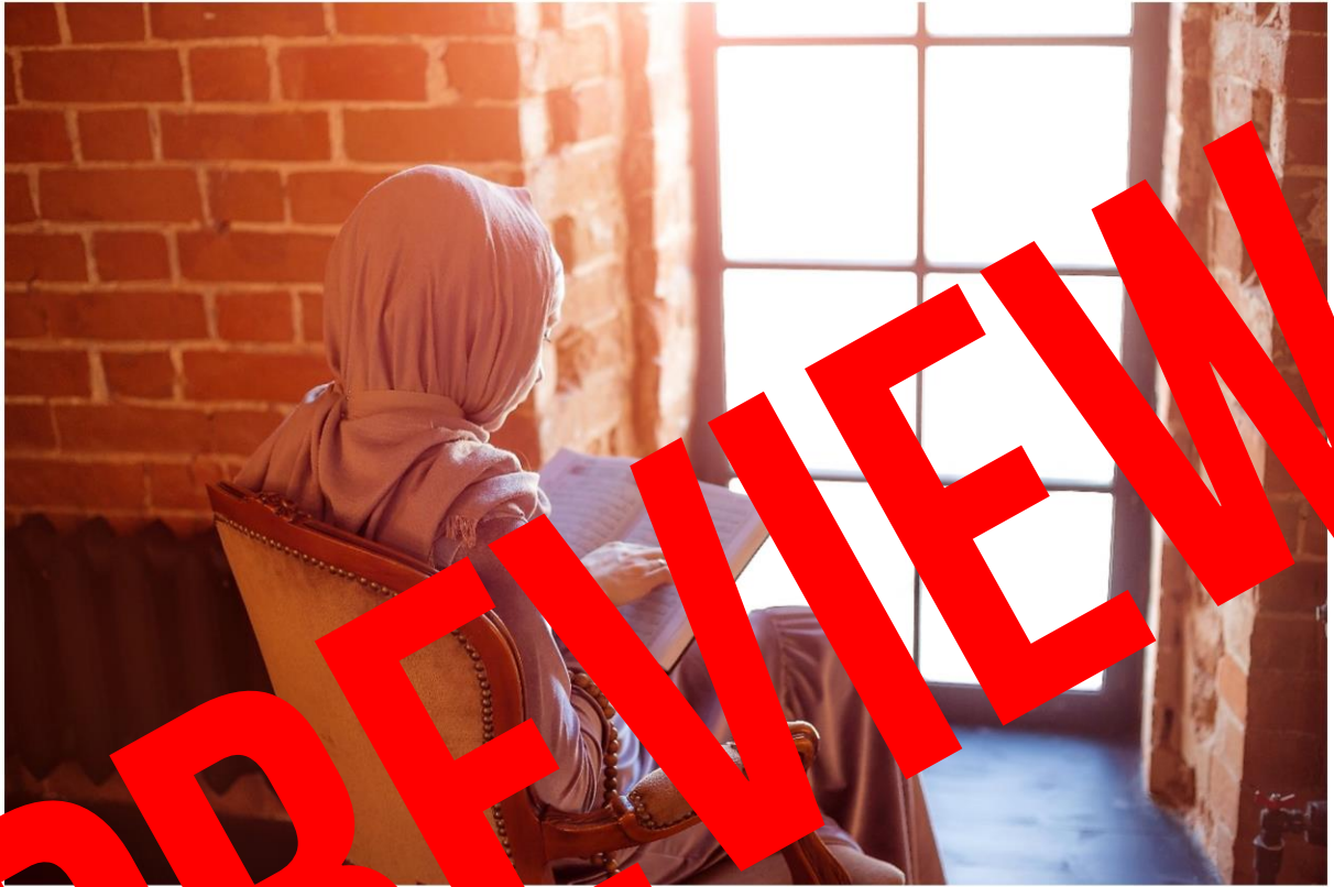
Muslim woman reading the Qu'ran