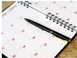
Mark April 1 st on the calendar.

April Fools' Day, also known as All Fools' Day was first popularized on April 1, 1700. The idea of April Fools is to prank each other, while having harmless fun. The annual tradition's exact roots, however, are still unknown.