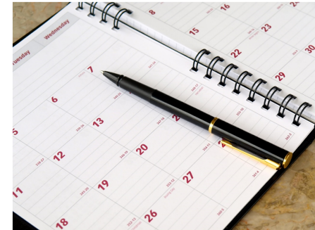
Mark April 1 st on the calendar.