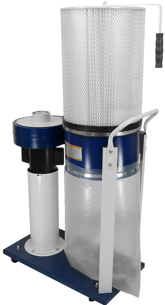
Shown with Dust Canister 60-900

1 HP Bag Set (Sets Include 1 Cloth Bag and 1 Clear Plastic Bag)