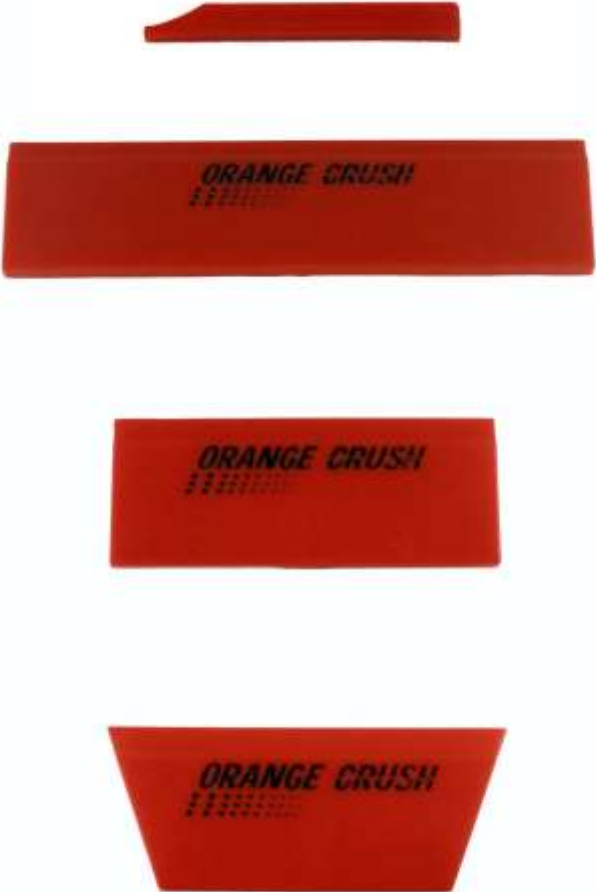
Side View- Beveled Edge

Orange Crush Squeegee Blades- In 2012 we redesigned our blade material that sets our blades apart from others. Completely scuff free! Our blades are injection molded using an exclusive patented process and offer consistent material density. The signature beveled edge ensures maximum liquid removal with every swipe. These blades have been designed to work perfectly in a Fusion Handle and also come in 8", 5" Standard, and 5" cropped sizes.