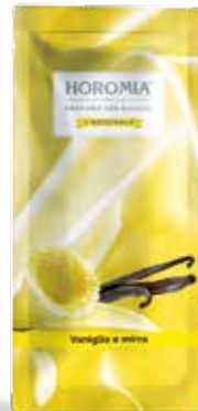
Vaniglia e Mirra