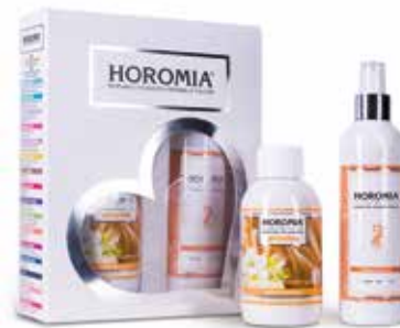
Vento d'Oriente Flowery, woody.