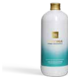
Lino e fior di cotone Flowery, mossy, woody.