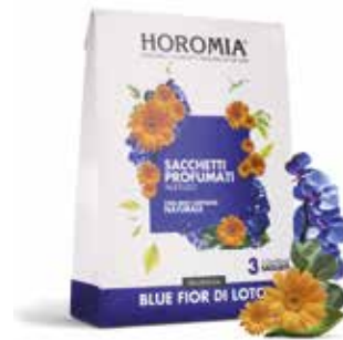
Blue Fior di loto Flowery, mossy.