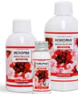
Imperial Soap Citrusy, flowery, with notes of vanilla.