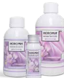
Brezza di Primavera Freesia, flowery, fresh and aromatic.