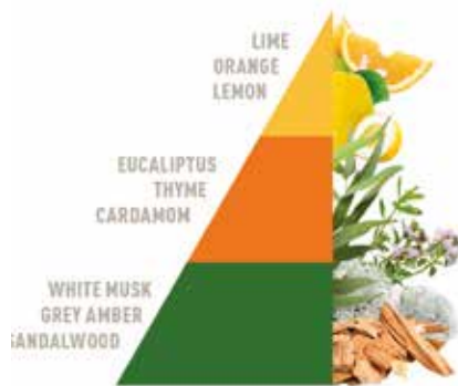
All'ombra degli aranci