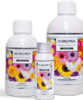
Liberty Flowery, fresh, citrusy.