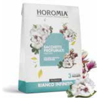
Bianco Infinito Mossy, flowery, rose-fragranced, aromatic.