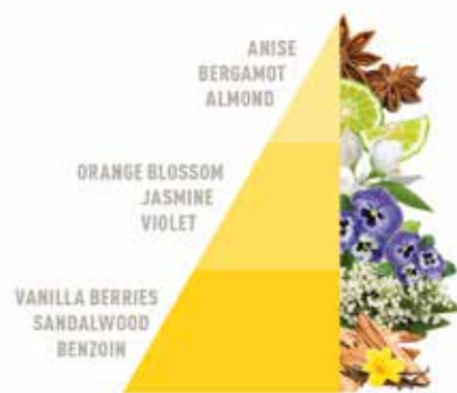
Vaniglia e benzoino