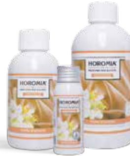
Vento d'Oriente Flowery, woody.