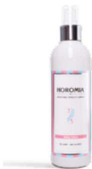
Baby Talco Flowery, fresh, mossy.