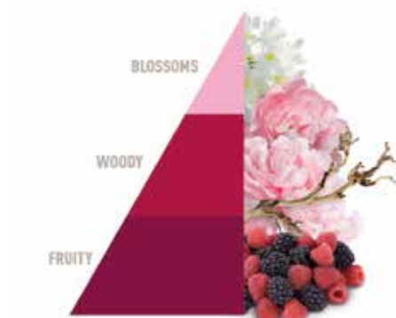
Petali di Peonia