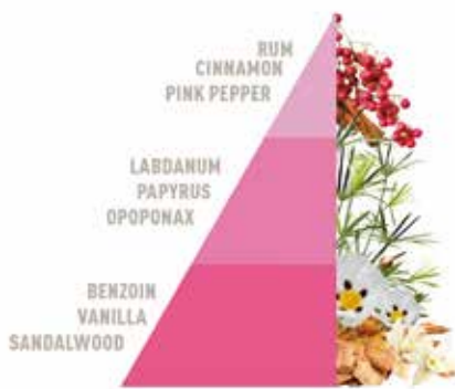
Sandolo e pepe rosa