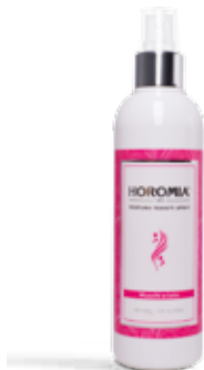
Muschi e Loto Flowery, fresh.