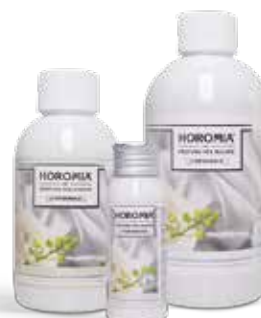
White Flowery with notes of aldehyde.