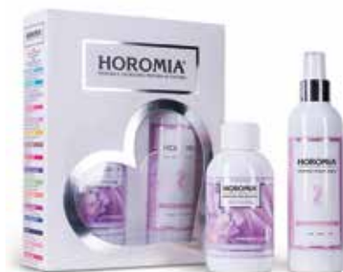
Brezza di Primavera Freesia, flowery, fresh and aromatic.