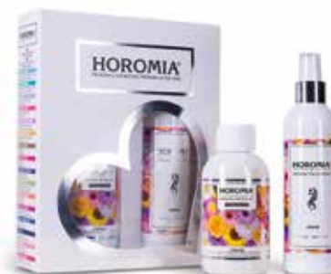
Liberty Flowery, fresh, citrusy.