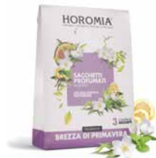
Brezza di Primavera Freesia, flowery, fresh and aromatic.