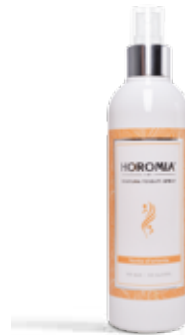
Vento d'Oriente Flowery, woody.