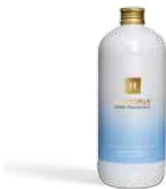
Brezza minerale Flowery, fresh, mossy.