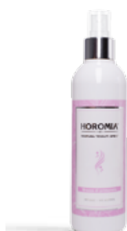
Brezza di Primavera Freesia, flowery, fresh and aromatic.