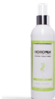
Musica del Sole Mossy, sweet, flower and powdery.