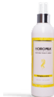
Vaniglia e Mirra Sweet, fruity, with notes of vanilla.