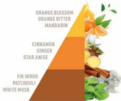
Arancio e cannella

Our fragrances are exclusive essences, composed of synthetic and natural oils, created to ensure an intense and long-lasting scent.