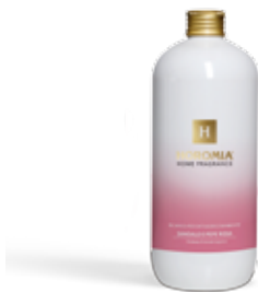
Sandalo e pepe rosa Amber, woody.