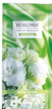
Musica del Sole