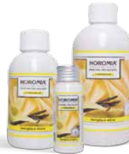
Vaniglia e Mirra Sweet, fruity, with notes of vanilla.