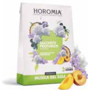
Musica del Sole Mossy, sweet, flower and powdery.