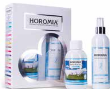
Fresh Cotton Flowery with notes of aldehyde, fresh, woody.