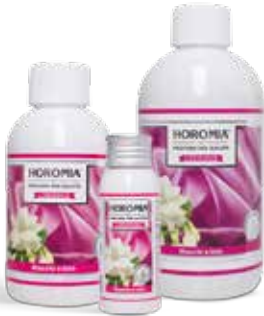
Muschi e Loto Flowery, fresh.