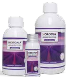
Aromatic Lavender Aromatic, fresh, flowery.

Horomia laundry fragrance is available in all fragrances and in 50ml, 250ml and 500ml sizes.