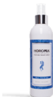
Blue Fior di loto Flowery, mossy.