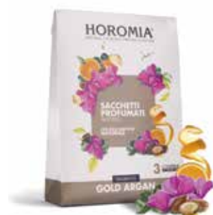
Gold Argan Woody, mossy.