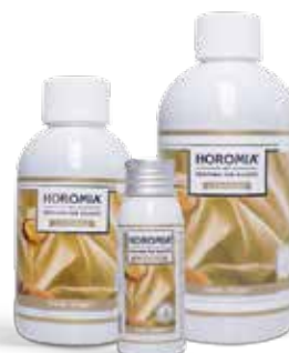
Gold Argan Woody, mossy.