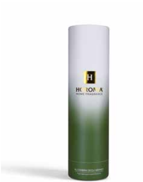
All'ombra degli aranci Fresh, citrusy, lime, mossy.