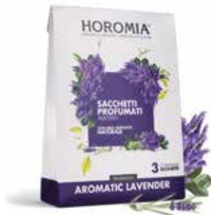
Aromatic Lavender Aromatic, fresh, flowery.

Available in all fragrances. Each package contains 3 scented sachets.