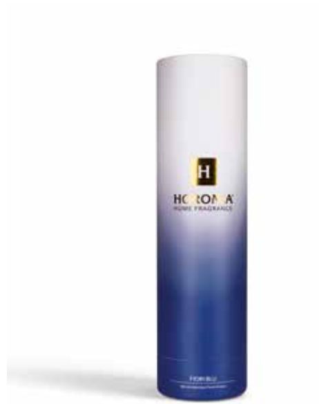
Fiori blu Spicy, flowery, fresh.