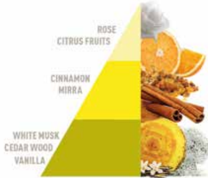
Vaniglia e Mirra

Our fragrances are not just perfumes, but exclusive essences, specifically created to ensure that laundry and fabrics remain pleasantly fragrant over time.