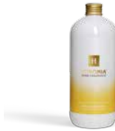
Vaniglia e benzoino Flowery, almond, sandal with notes of vanilla.