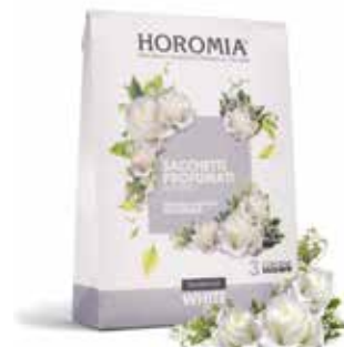
White Flowery with notes of aldehyde.