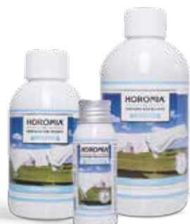
Fresh Cotton Flowery with notes of aldehyde, fresh, woody.