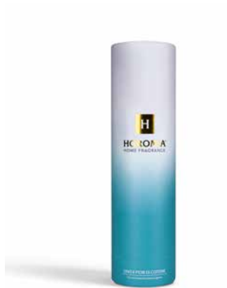
Lino e fior di cotone Flowery, mossy, woody.