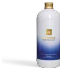
Fiori blu Spicy, flowery, fresh.