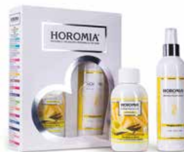
Vaniglia e Mirra Sweet, fruity, with notes of vanilla.