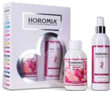
Petali di Peonia Fresh, blossoms, fruity, woody.