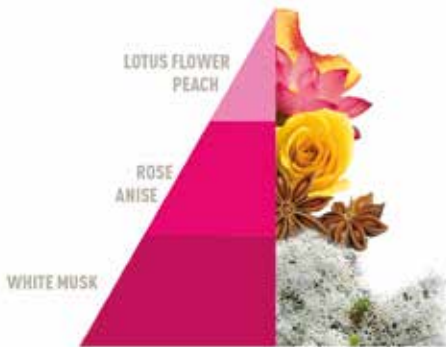
Muschi e Loto