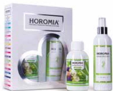
Musica del Sole Mossy, sweet, flower and powdery.