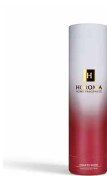
Vigneto rosso Notes of wine, fruity, sweet and green.