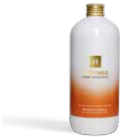
Arancio e cannella Citrusy, spicy, fruity e Mossy.