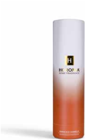
Arancio e cannella Citrusy, spicy, fruity e Mossy.

Room diffuser sticks available in 8 fragrances. Product includes fragrance in 200ml size and rattan stick.