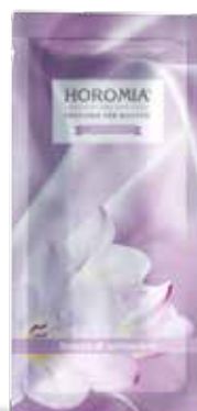
Brezza di Primavera