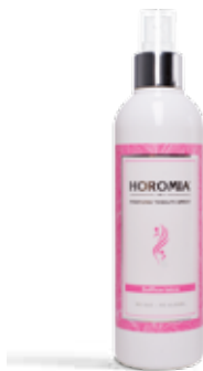
Soffice Talco Flowery with notes of talc.