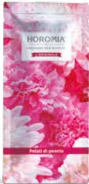
Petali di Peonia