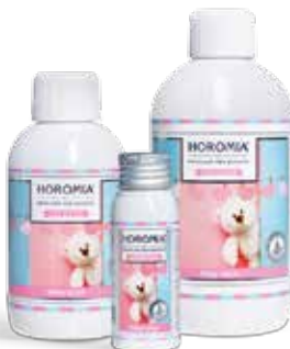
Baby Talco Flowery, fresh, mossy.