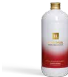
Vigneto rosso Notes of wine, fruity, sweet and green.