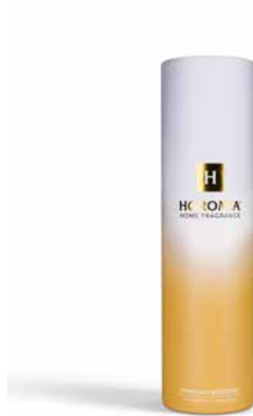
Vaniglia e benzoino Flowery, almond, sandal with notes of vanilla.