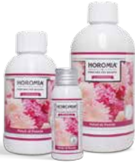
Petali di Peonia Fresh, blossoms, fruity, woody.