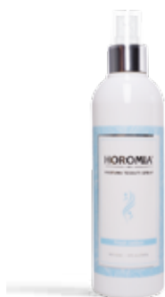
Fresh Cotton Flowery with notes of aldehyde, fresh, woody.