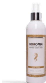
Gold Argan Woody, mossy.