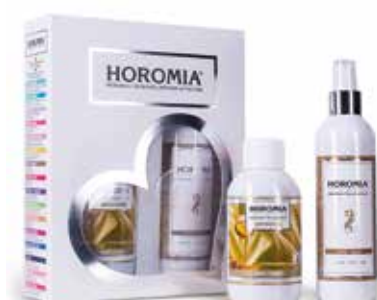
Gold Argan Woody, mossy.