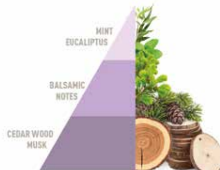
Brezza di Primavera