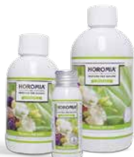
Musica del Sole Mossy, sweet, flower and powdery.