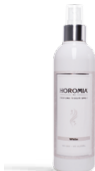
White Flowery with notes of aldehyde.