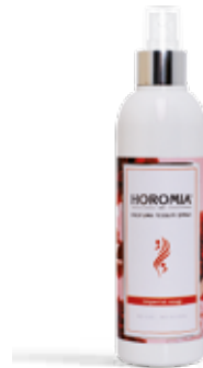
Imperial Soap Citrusy, flowery, with notes of vanilla.