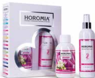
Muschi e Loto Flowery, fresh.