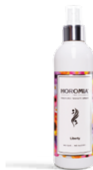
Liberty Flowery, fresh, citrusy.