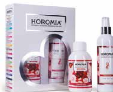
Imperial Soap Citrusy, flowery, with notes of vanilla.