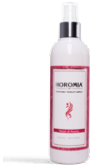
Petali di Peonia Fresh, blossoms, fruity, woody.