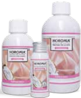
Soffice Talco Flowery with notes of talc.