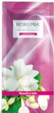
Muschi e Loto