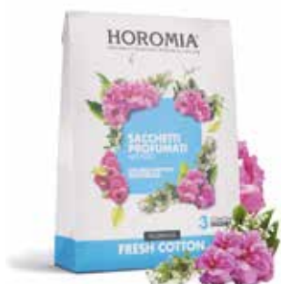
Fresh Cotton Flowery with notes of aldehyde, fresh, woody.