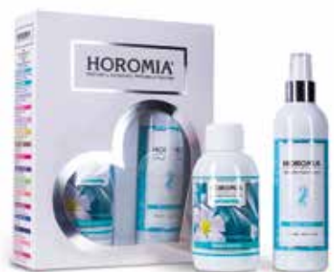
Bianco Infinito Mossy, flowery, rose-fragranced, aromatic.