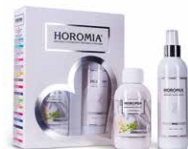
White Flowery with notes of aldehyde.