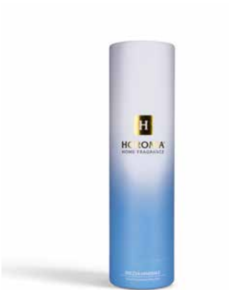
Brezza minerale Flowery, fresh, mossy.