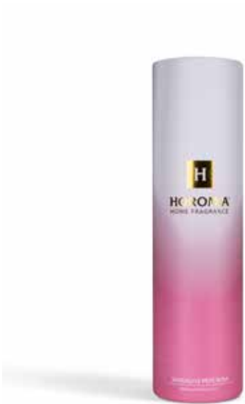
Sandalo e pepe rosa Amber, woody.