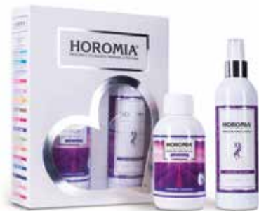
Aromatic Lavender Aromatic, fresh, flowery.

Duo laundry perfume and Spray-on fabric perfume in 250ml format. Available in all fragrances.