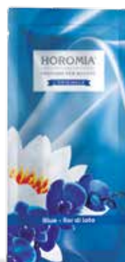
Blue Fior di loto