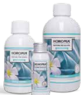
Bianco Infinito Mossy, flowery, rose-fragranced, aromatic.