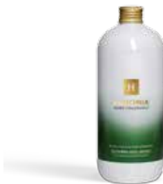
All'ombra degli aranci Fresh, citrusy, lime, mossy.