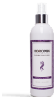
Aromatic Lavender Aromatic, fresh, flowery.

Spray-on fabric perfume is available in all fragrances in 250ml format.