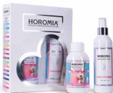
Baby Talco Flowery, fresh, mossy.