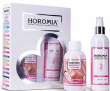
Soffice Talco Flowery with notes of talc.