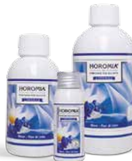
Blue Fior di loto Flowery, mossy.