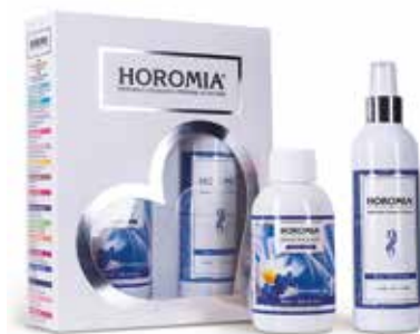
Blue Fior di loto Flowery, mossy.