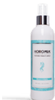
Bianco Infinito Mossy, flowery, rose-fragranced, aromatic.