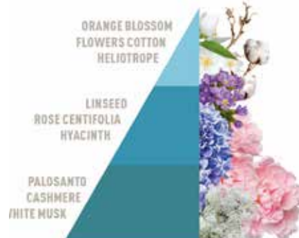
Lino e fior di cotone