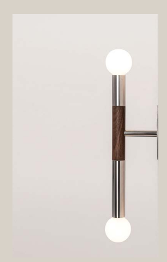
Walnut + Polished Chrome