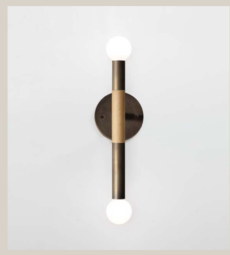
Aged Brass + White Oak