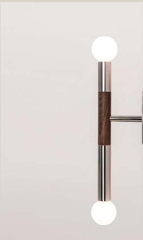
Walnut + Polished Chrome