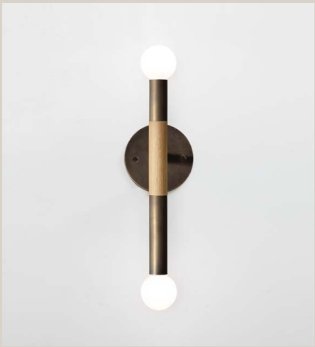
Aged Brass + White Oak