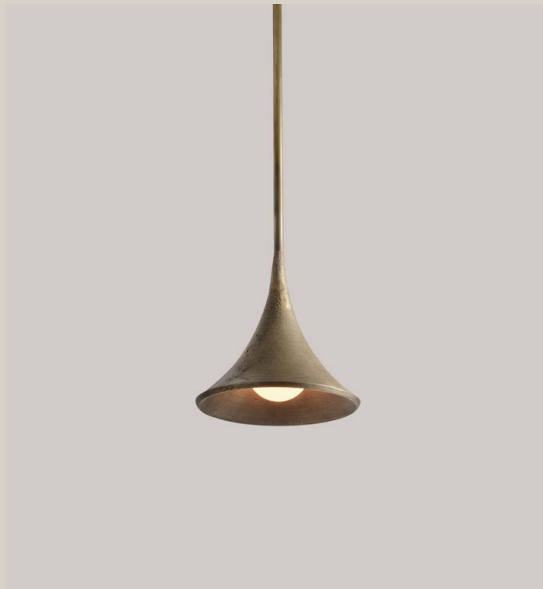
Aged Manganese Bronze