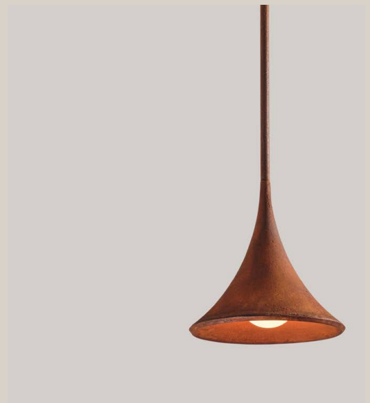
Corten Cast Iron