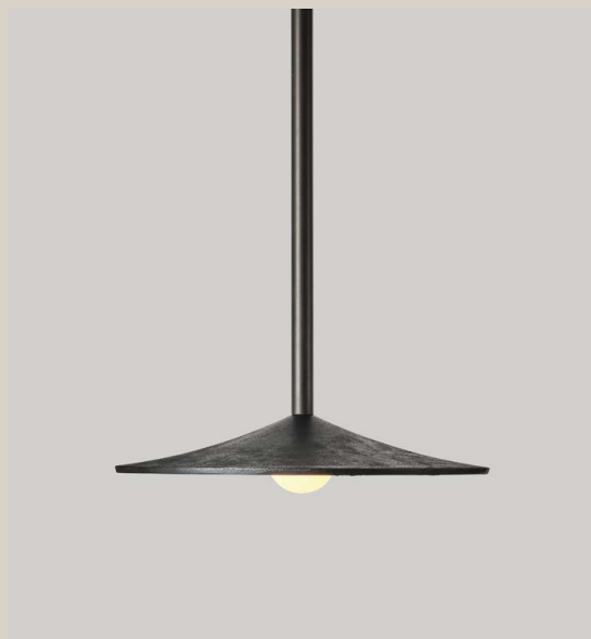
Blackened Cast Iron

Emery Allen LED G9 4.5W 2700K dimmable, included