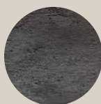
Blackened Cast Iron