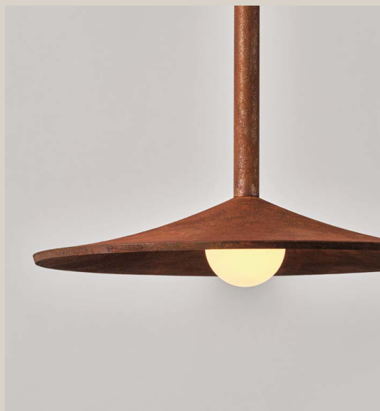
Corten Cast Iron