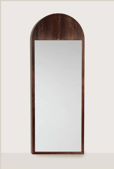
Walnut + Clear Mirror