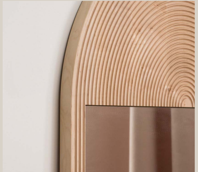
Hard Maple + Clear Mirror