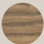
'Grey Fog' White Oak