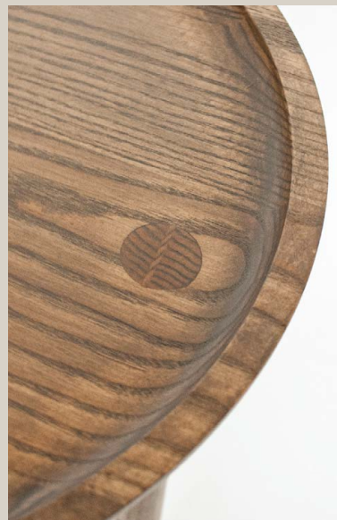
'Grey Fog' White Oak