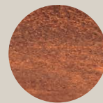
Corten Cast Iron