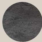
Blackened Cast Iron