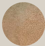
Verdigris Manganese Bronze