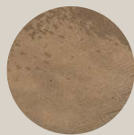
Gently Aged Manganese Bronze