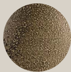
Aged Manganese Bronze