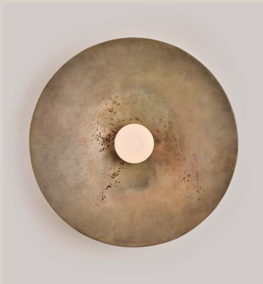
Verdigris Manganese Bronze

Emery Allen LED G9 4.5W 2700K dimmable, included